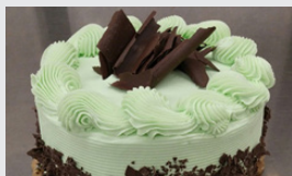
Creme De Menthe Cake

Devil's food cake layered and finished with mint-flavored mousse. Garnished with chocolate shavings