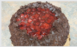
Chocolate Raspberry Torte

Devil's food cake filled with chocolate mousse, raspberries, raspberry jam and whipped cream. Sculpted with chocolate shavings.