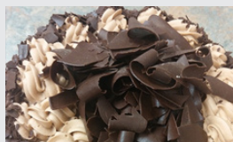
Bailey's Irish Cream Torte

Three layers of chocolate devil's food cake with two layers of Bailey's mousse garnished with mousse and chocolate shavings.