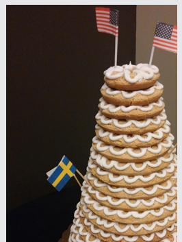
Kransekake - 9 Ring Cake $110

A 9-tiered Scandinavian holiday treat. You can choose from two different decorations: White Fondant Balls or Daisies. This tasty treat is made from almond paste, sugar, egg white and icing.