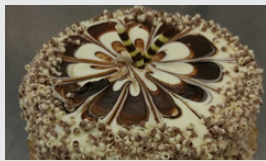
Chocolate Symphony Cake

Layers of chocolate devil's food cake and layers of rich cream cheese frosting. Garnished with chocolate shavings and a swirled chocolate-cream cheese.