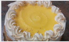
English Lemon Cake

Three layers yellow sponge cake with two layers of fresh lemon curd, garnished with lemon curd, whipped cream and lattice top.