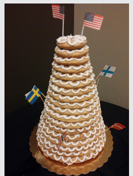
Kransekake - 9 Ring Cake $95

A 9-tiered Scandinavian holiday treat. You can choose from two different decorations: White Fondant Balls or Daisies. This tasty treat is made from almond paste, sugar, egg white and icing.