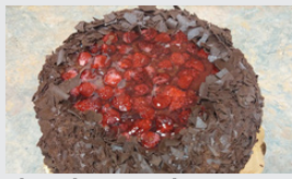
Chocolate Raspberry Torte

Devil's food cake filled with chocolate mousse, raspberries, raspberry jam and whipped cream. Sculpted with chocolate shavings.